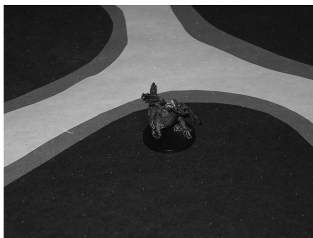
A Fang Dragon awaits his next victim!